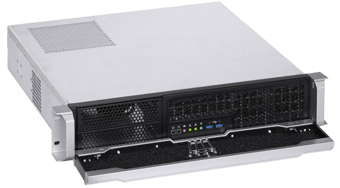
Front view (open)