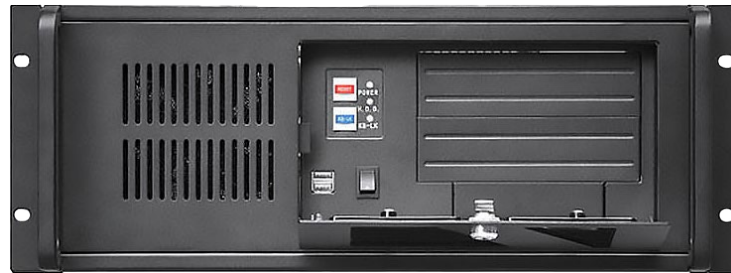
Front view (open)