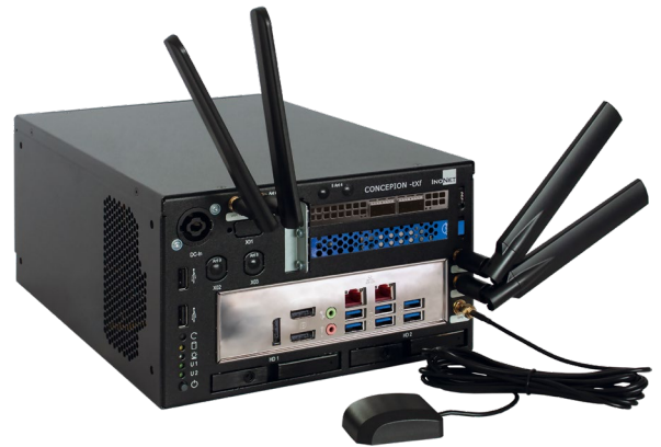
Wi-Fi/Bluetooth and GNSS/LTE (optional) (Fig. without QuickTray®-v3 extension)